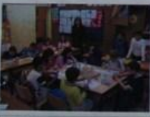
Slika 10. Učestvovanje u natjecanju.