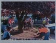
Slika 7. Cvjećari uređuju vrtnebeće vrtište.