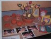
Slika 5. Prirodoljaci pripremaju Likovni skupine.