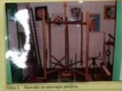
Slika 3. Stara tkalačka stana.