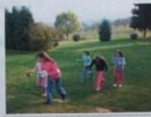
Slika 2. Mali prirodoljaci čiste okoliš nafta bašte.