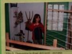
Slika 9. Učenice u radionici.