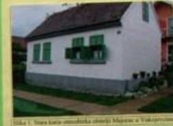
Slika 1. Stara kuća u Vukojevcima.

U staroj obiteljskoj kući gospodina Ivica Majurca u Vukojevcima učenice 6. i 7. razreda uče tkati na tkalačkom stanu.