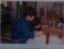
Slika 13. Učestvovanje u pripremi radu.