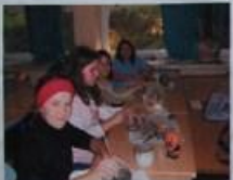
Slika 4. Ljubitelji izradaju keramičke posude.