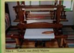
Slika 4. Stara tkalačka stana.