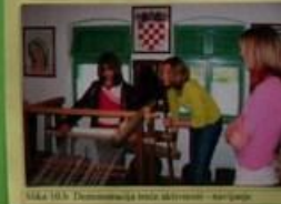
Slika 11. Učenice u radionici.