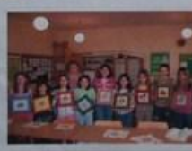
Slika 11. Mali vrtljaci u pripremi pakiranja sadova.