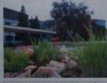
Slika 14. Priprema u kuhinjskom vrtu.