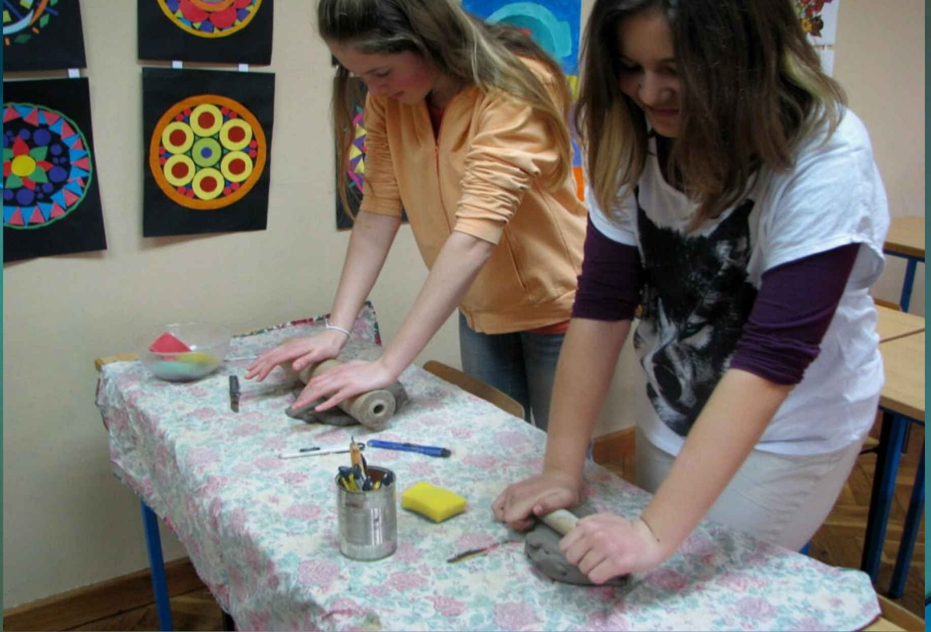
Making decorative pottery in the art workshop