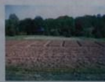
Slika 15. Priprema u kuhinjskom vrtu.