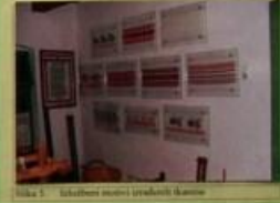
Slika 5. Stara tkalačka stana.