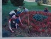
Slika 8. Mali cvjećari uređuju vrtnebeće vrtište.