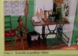
Slika 2. Kućna radionica.