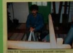
Slika 10. Učenice u radionici.