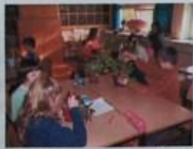
Slika 1. Mali prirodoljaci uređuju vrtnebeće vrtište.