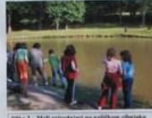
Slika 3. Mali prirodoljaci na nativnom ribnjaku.