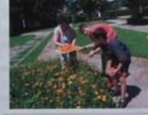
Slika 6. Cvjećari beru cvjetne vrtište.