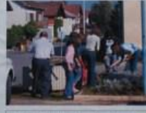
Slika 9. Hortikulturne skupine uređuju okoliš.