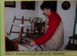
Slika 8. Učenice u radionici.