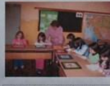
Slika 12. Učestvovanje u pripremi radu.