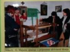
Slika 6. Učenice u radionici.