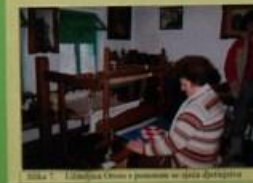
Slika 7. Učenice u radionici.